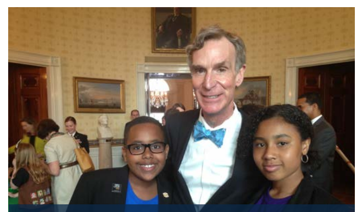
Two Boys & Girls Club youth attended the White House Science Fair and met STEM luminary Bill Nye as representatives of Time Warner Cable's Connect a Million Minds initiative. Both youth participate in BGCA's DIY STEM program, which is supported by Time Warner Cable.